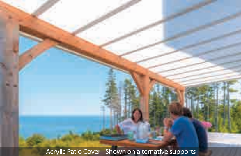
Acrylic Patio Cover - Shown on alternative supports