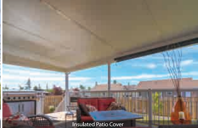
Insulated Patio Cover