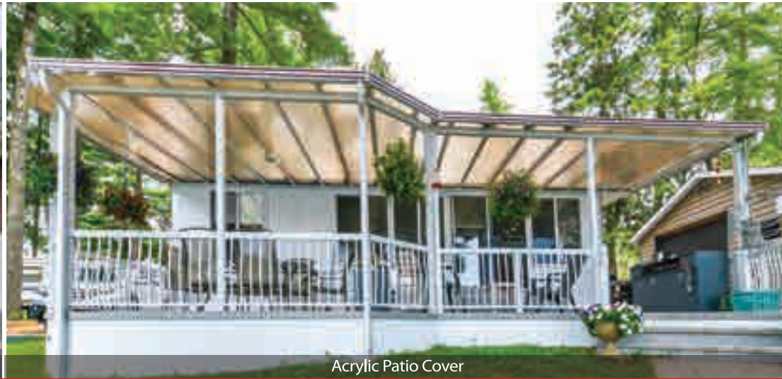
Acrylic Patio Cover