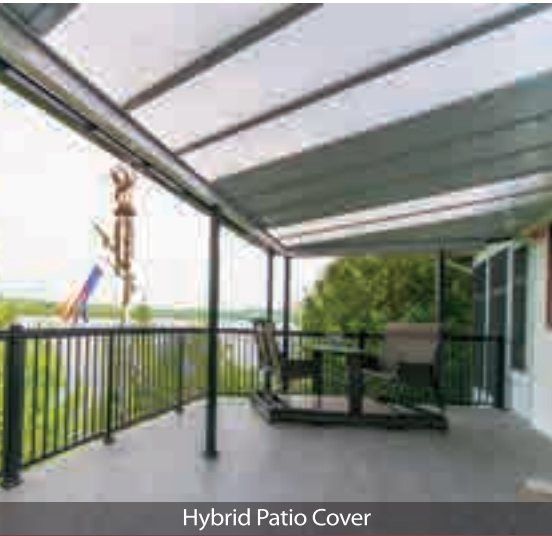
Hybrid Patio Cover